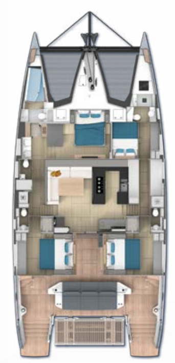
galley up master suite 3 guest cabins crew cabin option

galley up master suite 2 guest cabins crew quarter option